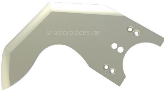
Feuring Cut Form

For an offer we need the following information: